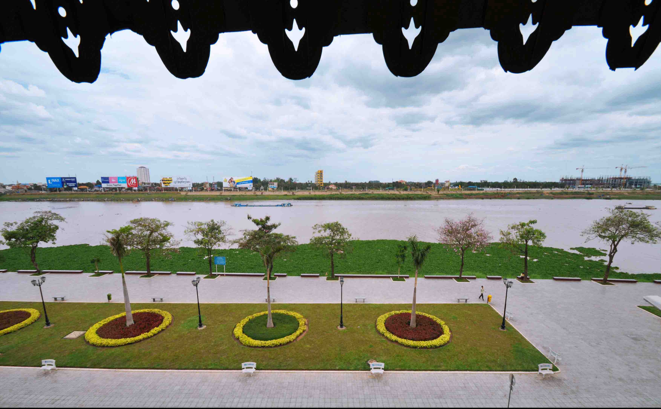
Unrivalled and absolute direct river frontage view from both floors