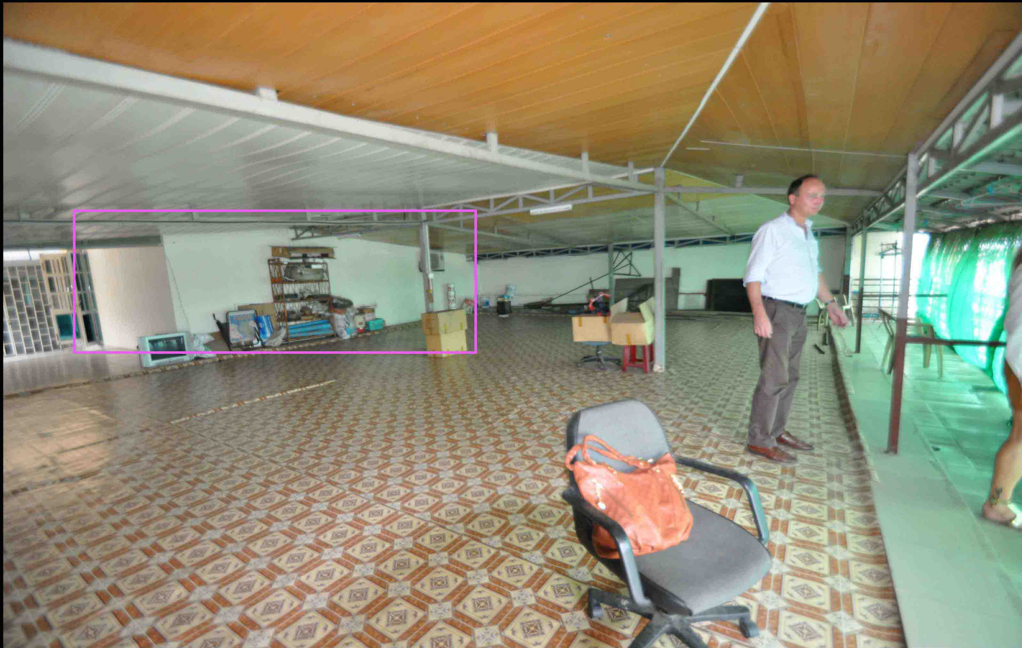
Upper floor - view looking back from the balcony. The room at the rear currently houses a lounge, bedroom, kitchen and bathroom however the entire floor can be reconfigured. Self contained entrance.