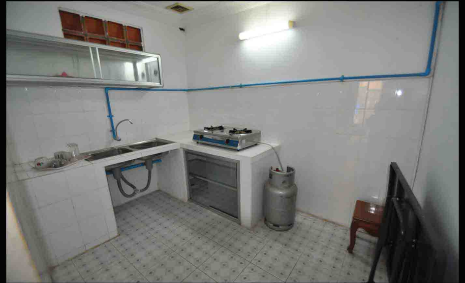
Upper floor - Current configuration of the room at the rear section - lounge, bedroom, kitchen and bathroom