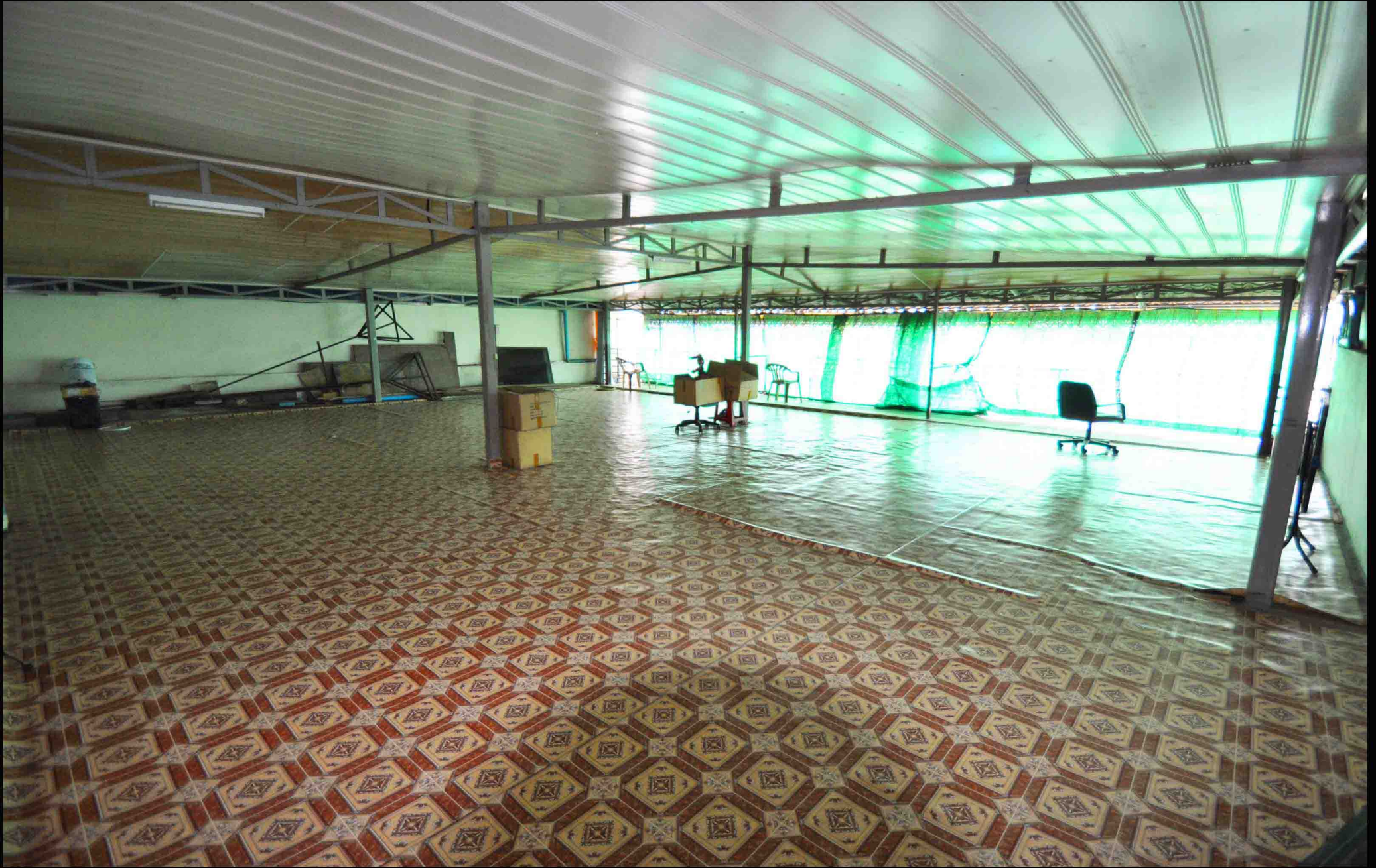
Upper floor - Simply huge 20m x 13m (260sqm) open plan room with 20m balcony and view. Suitable for a variety of refit options