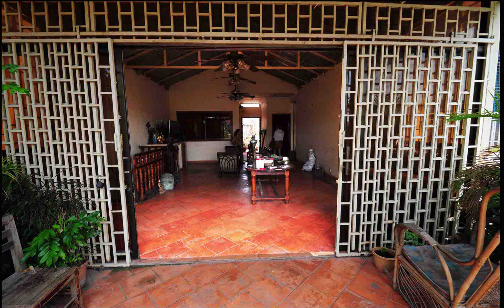
View into 100sqm upper floor from roof top garden. Staircase on left, Bedroom, bathroom and rear outside terrace ar rear