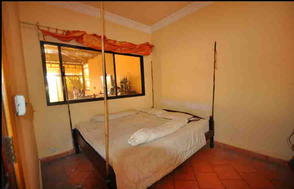
Spacious bedrooms and bathrooms