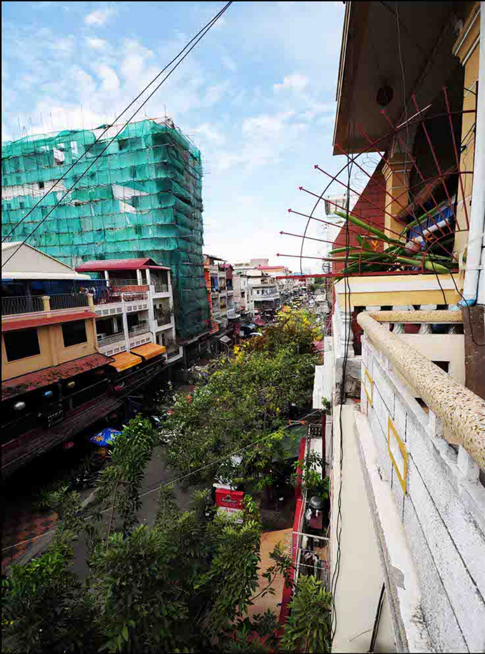
View right from lower floor balcony