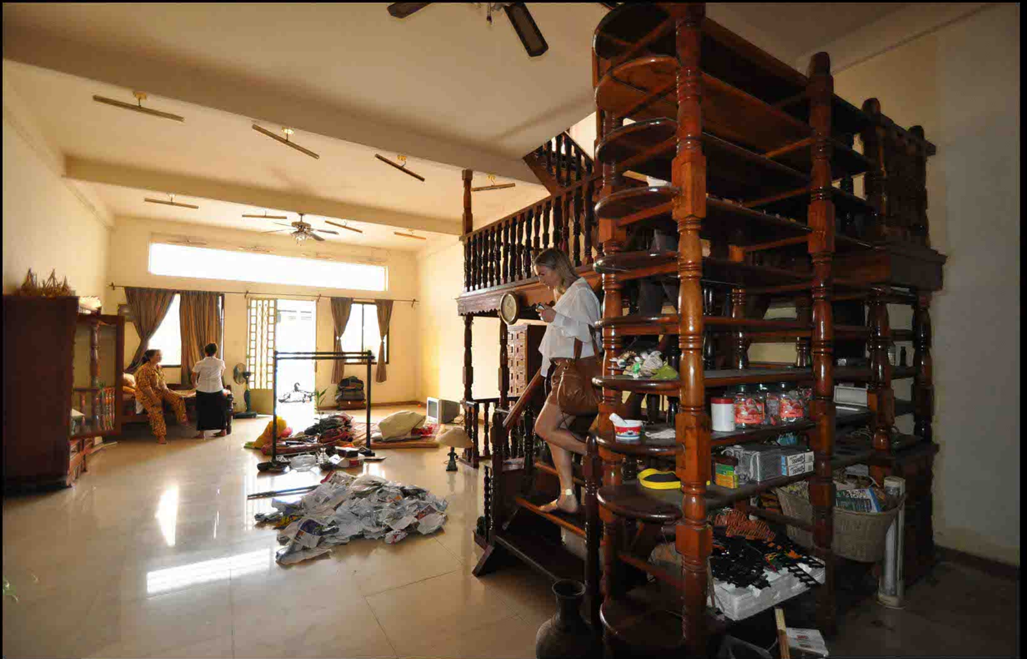
Lower floor with balcony at rear