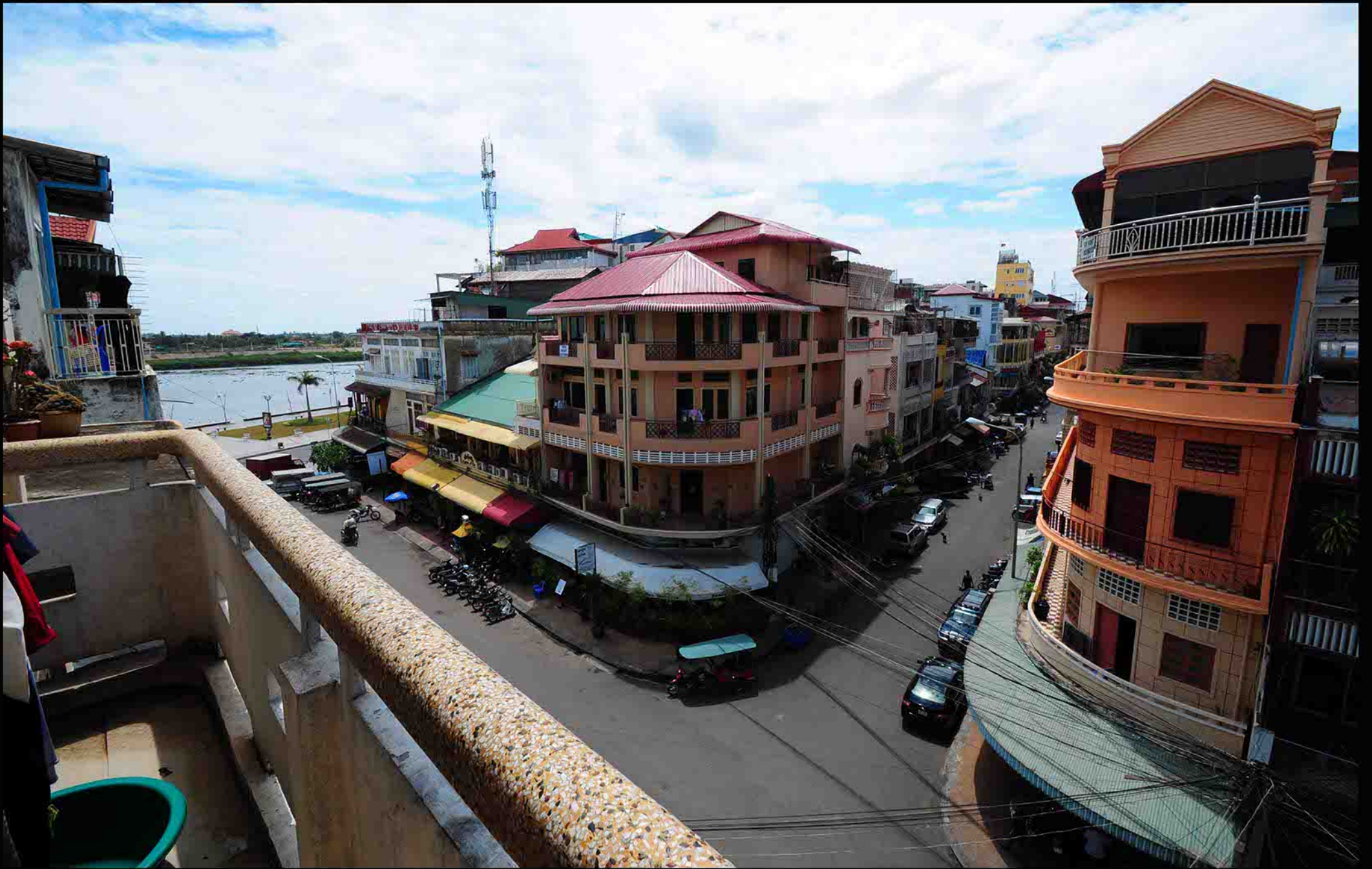
River view from lower floor balcony