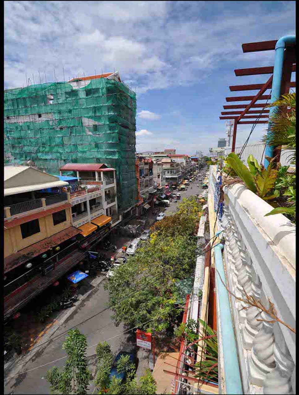
View right from rooftop garden