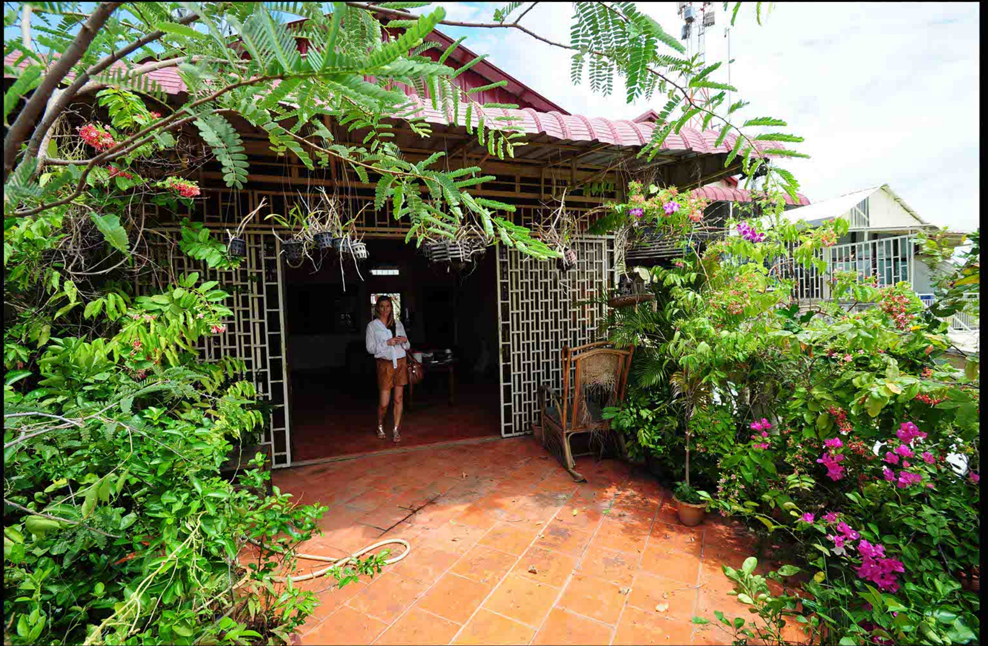
Private roof top garden