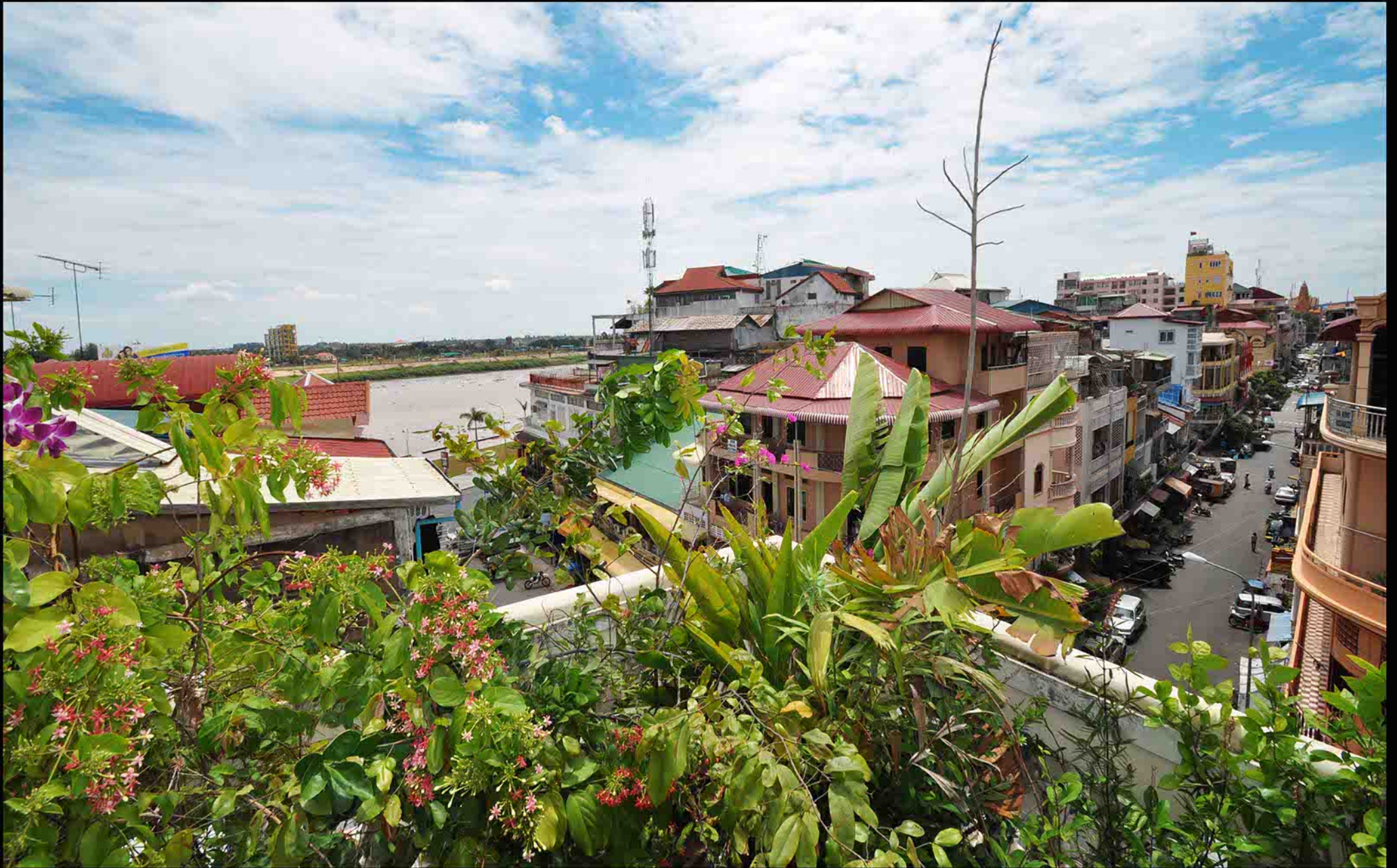
View from rooftop garden with East to West views for sunshine morning through to sunset.