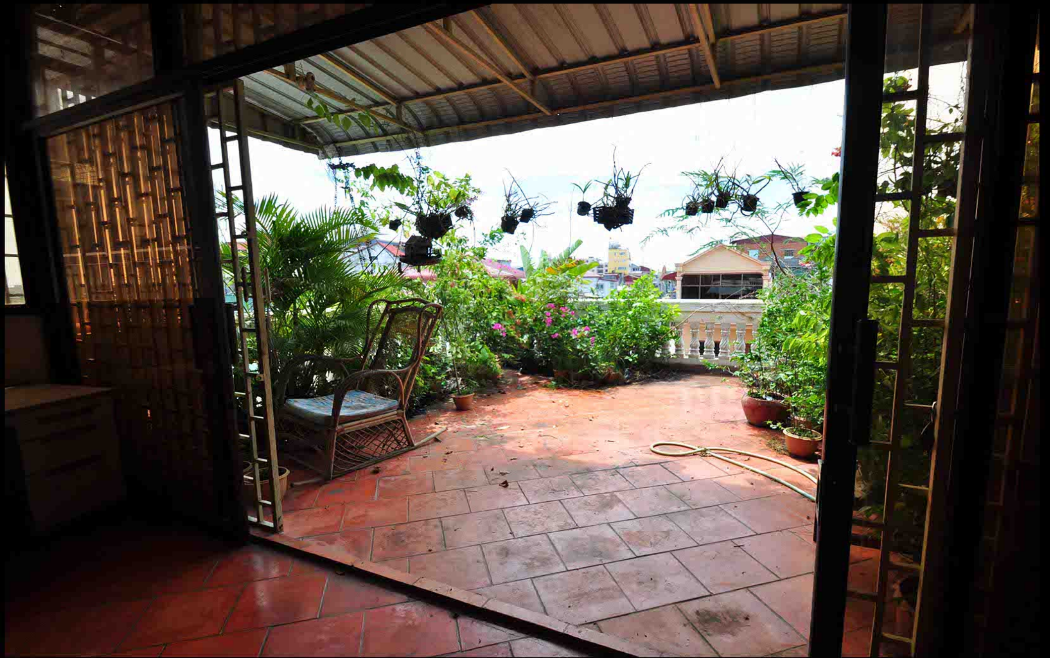
View looking out onto roof top garden from upper floor