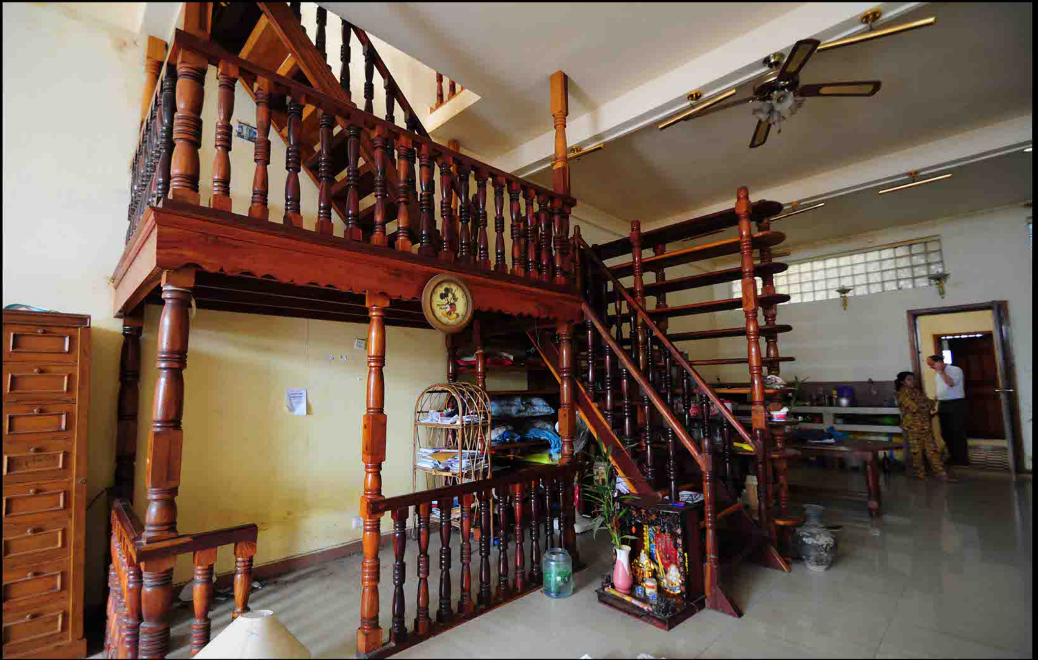
Internal polished timber staircase joining lower and upper floors