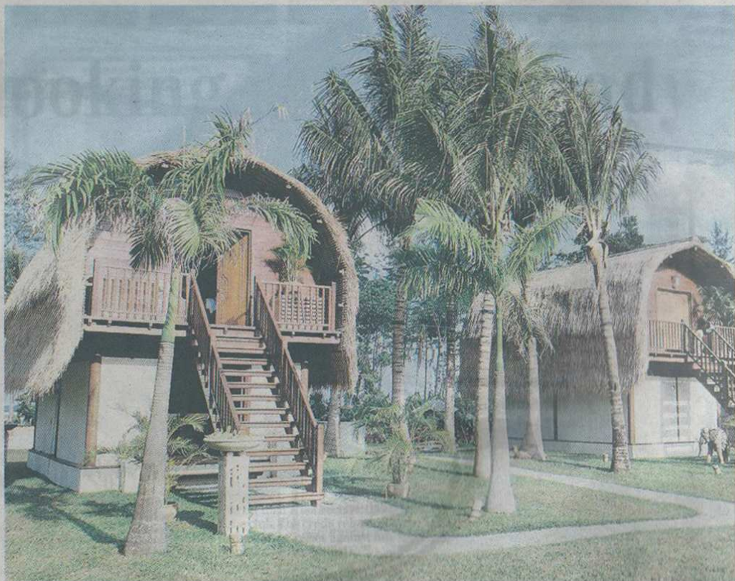
The exclusive villas in Kudat Riviera are targeted at high-end investors and holiday-makers who are seeking a luxury getaway in a tropical paradise.

"It will be interesting to see this growth, and we only hope that the ensuing developments will be environmentally and culturally responsible to ensure that Sabah's rich heritage is not impacted by a big