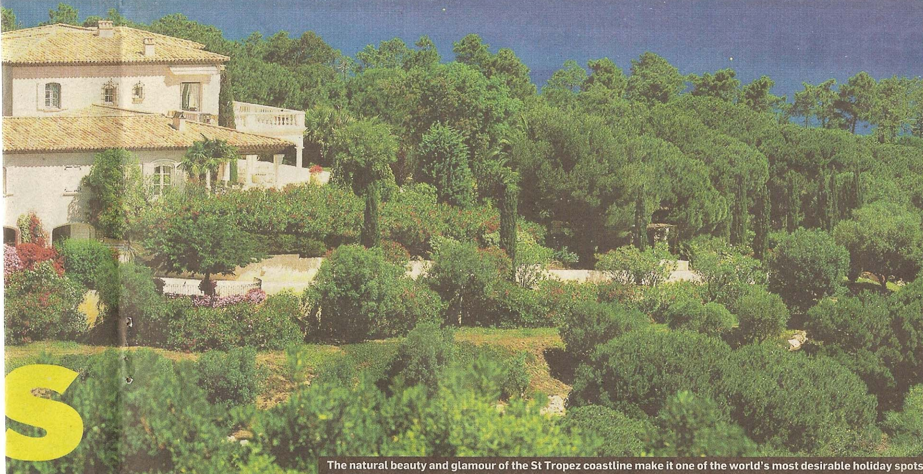
The natural beauty and glamour of the St Tropez coastline make it one of the world's most desirable holiday spots

If you want to pay slightly less, you should try the Livathos area, in the south of the island. A 10-minute drive from Argostoli, the capital, within easy reach of the beach, a new-build, three-bedroom house with a pool can be had for £300,000-£350,000. Rental prospects in Cephalonia are strong: the season is long and a three-bedroom villa will let out for £850-£1,400 a week. Buying is easy — all you need is a local tax number and a Greek bank account. Mortgages are fairly easy to obtain, with rates lower than in Britain.